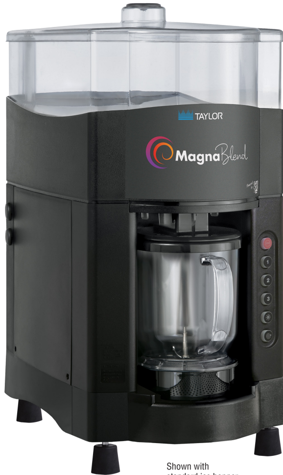
Shown with standard ice hopper