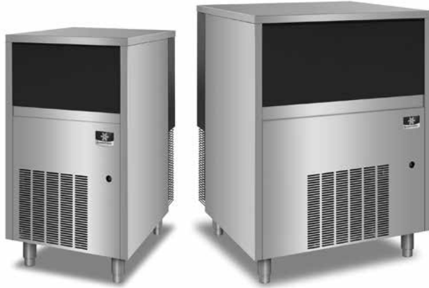
Model RNS-0244A Nugget Ice Machine